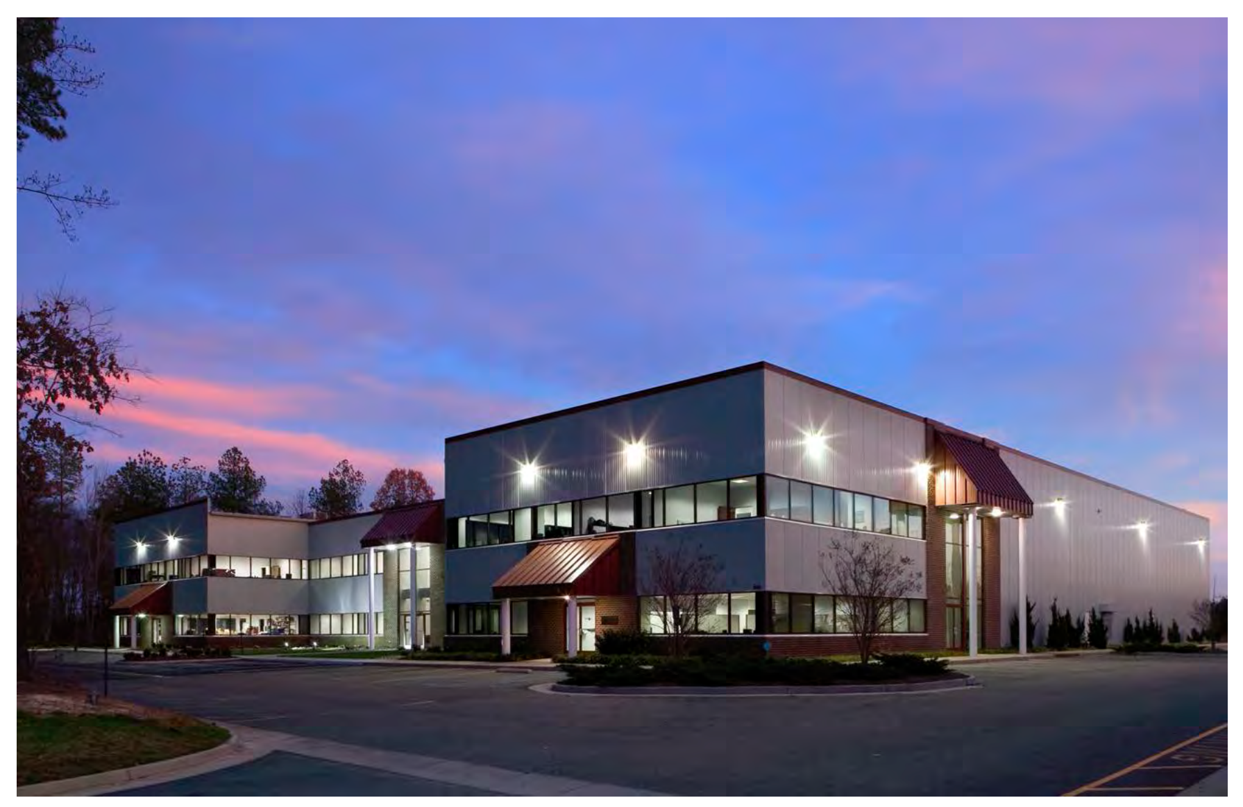
Ryson International / Yorktown, VA 50,000 sf industrial manufacturing facility