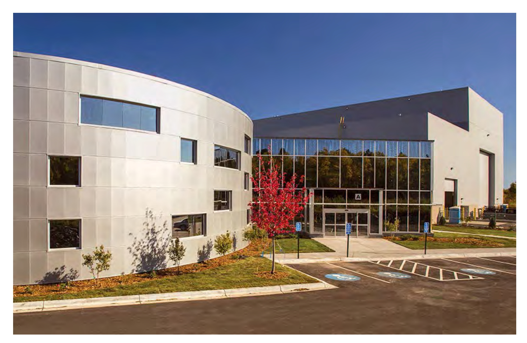
P & H Mine Pro / Virginia, MN

105,000 sf State-of-the-art mining maintenance facility with office, bridge cranes & mezzanines