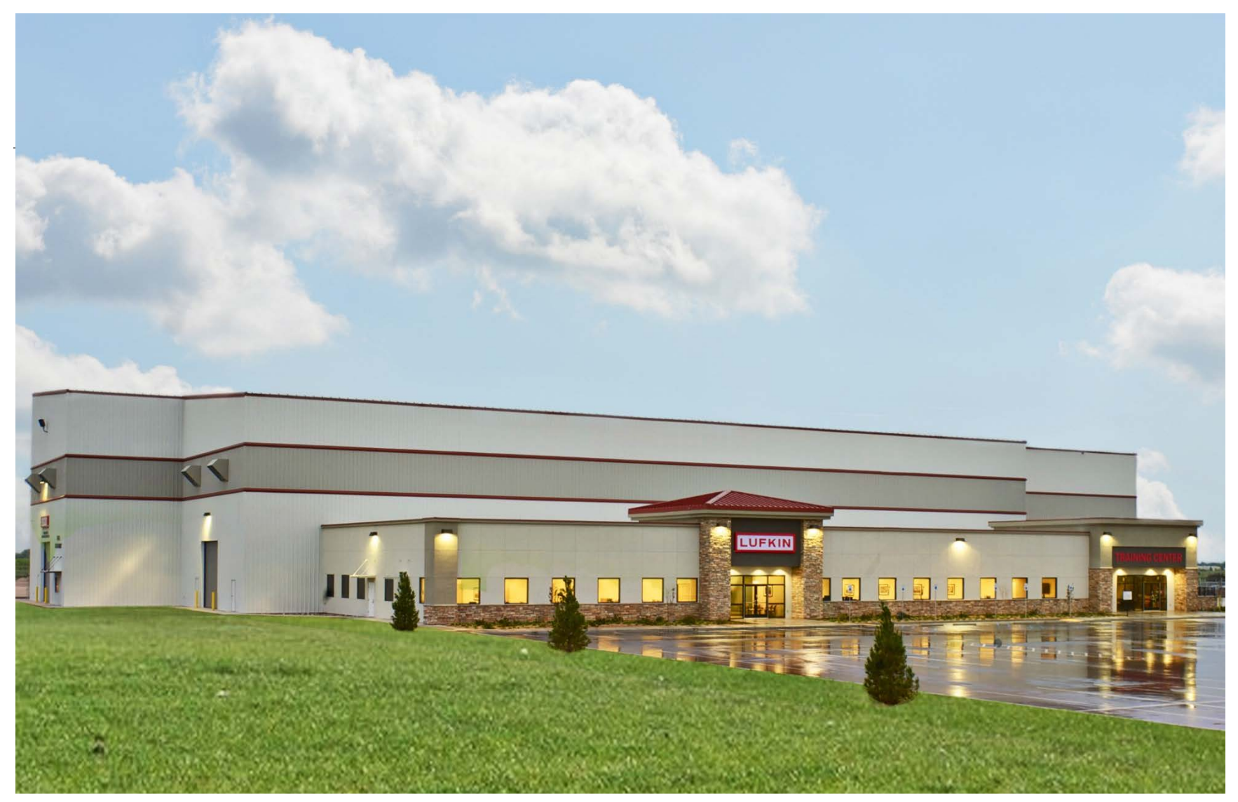
Lufkin Industrial Crane Building / Odessa, TX 40,400 sf single slope oil field operations facility