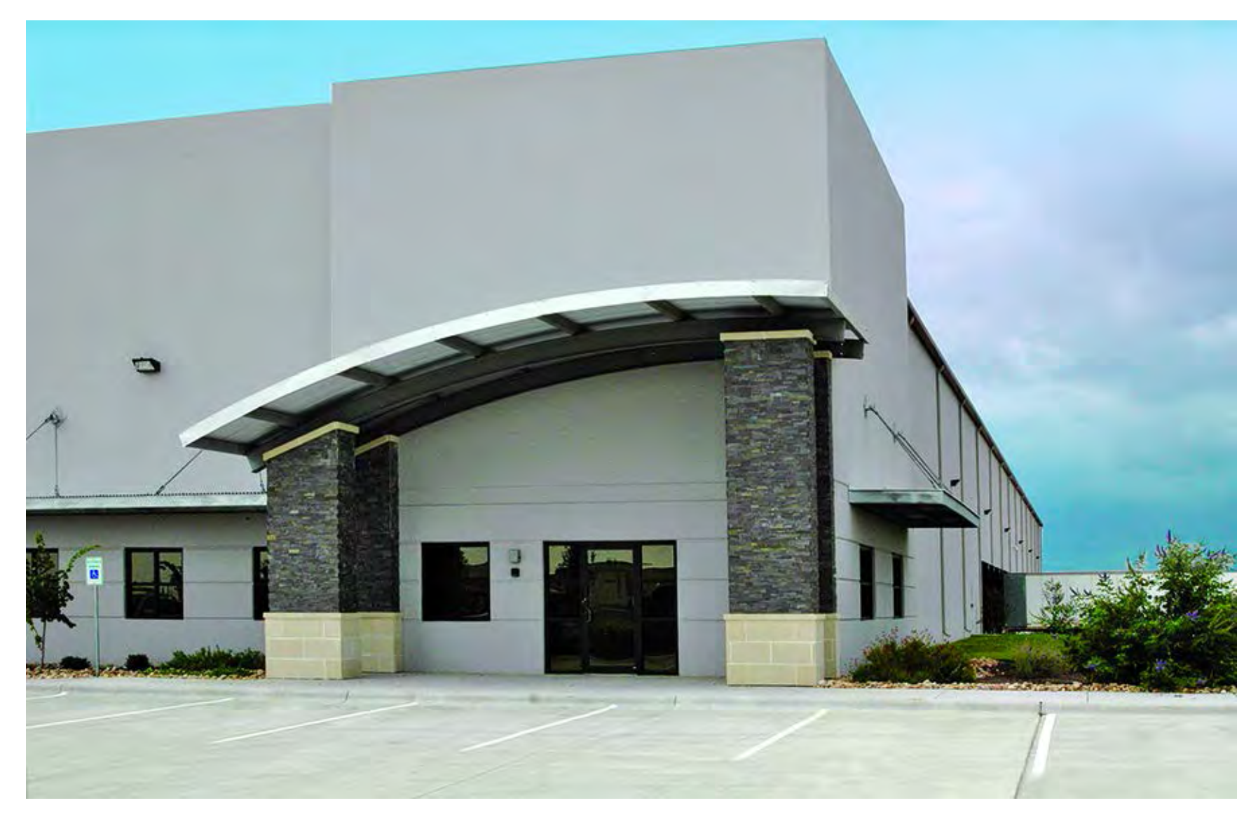
Northland Oil Products/ Temple, TX

61,300 sf Manufacturing and distribution facility for lubricating oil and coolant with tilt wall finish