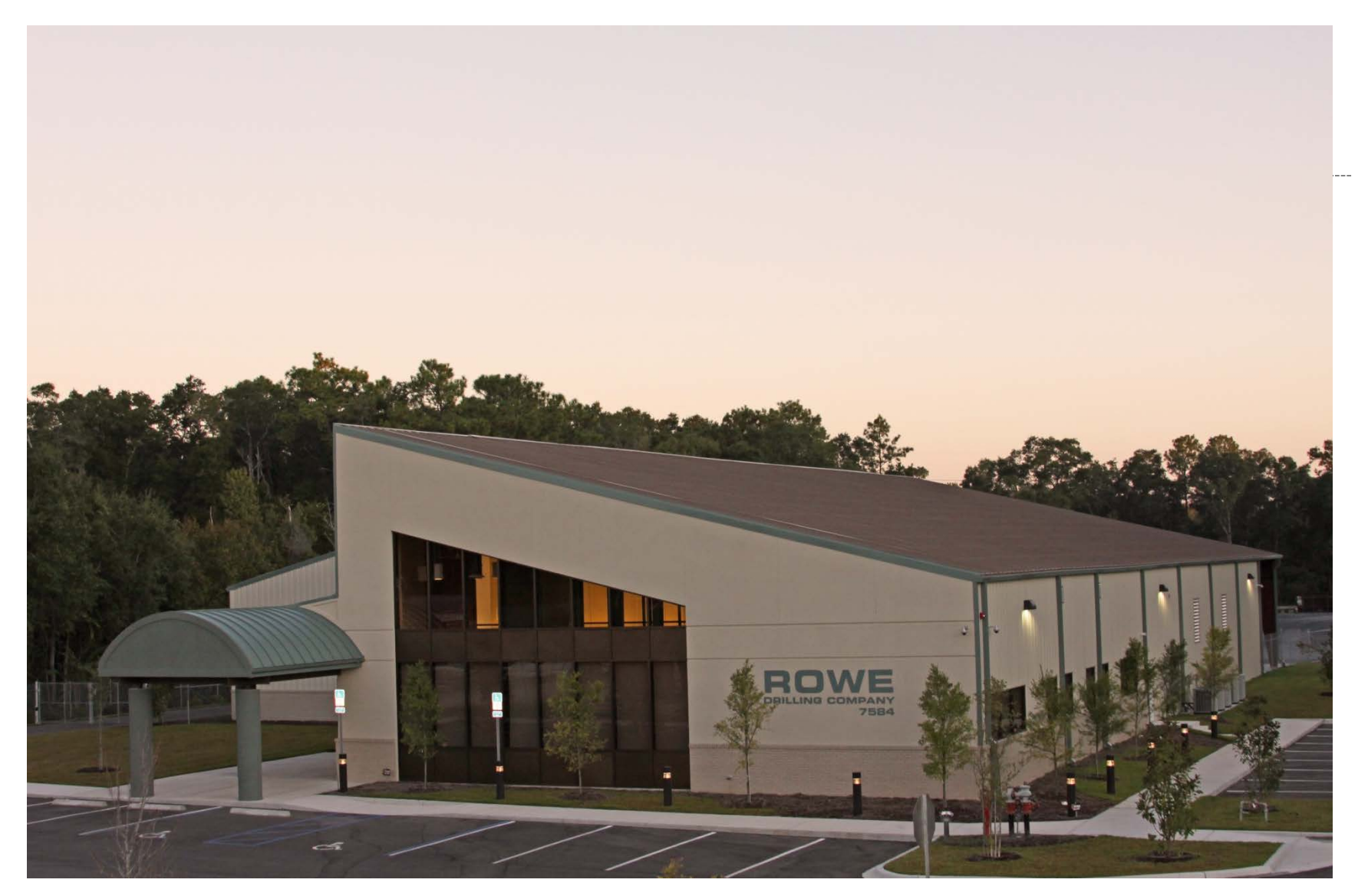
Rowe Drilling / Tallahassee, FL

21,375 sf Drilling company facility with partial mezzanine