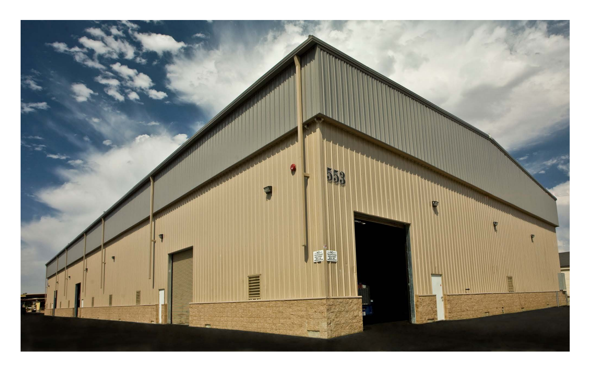
Viking Industries/ Pittsburg, CA

31,000 sf Flat rolled steel processing plant with full length 30-ton top running crane