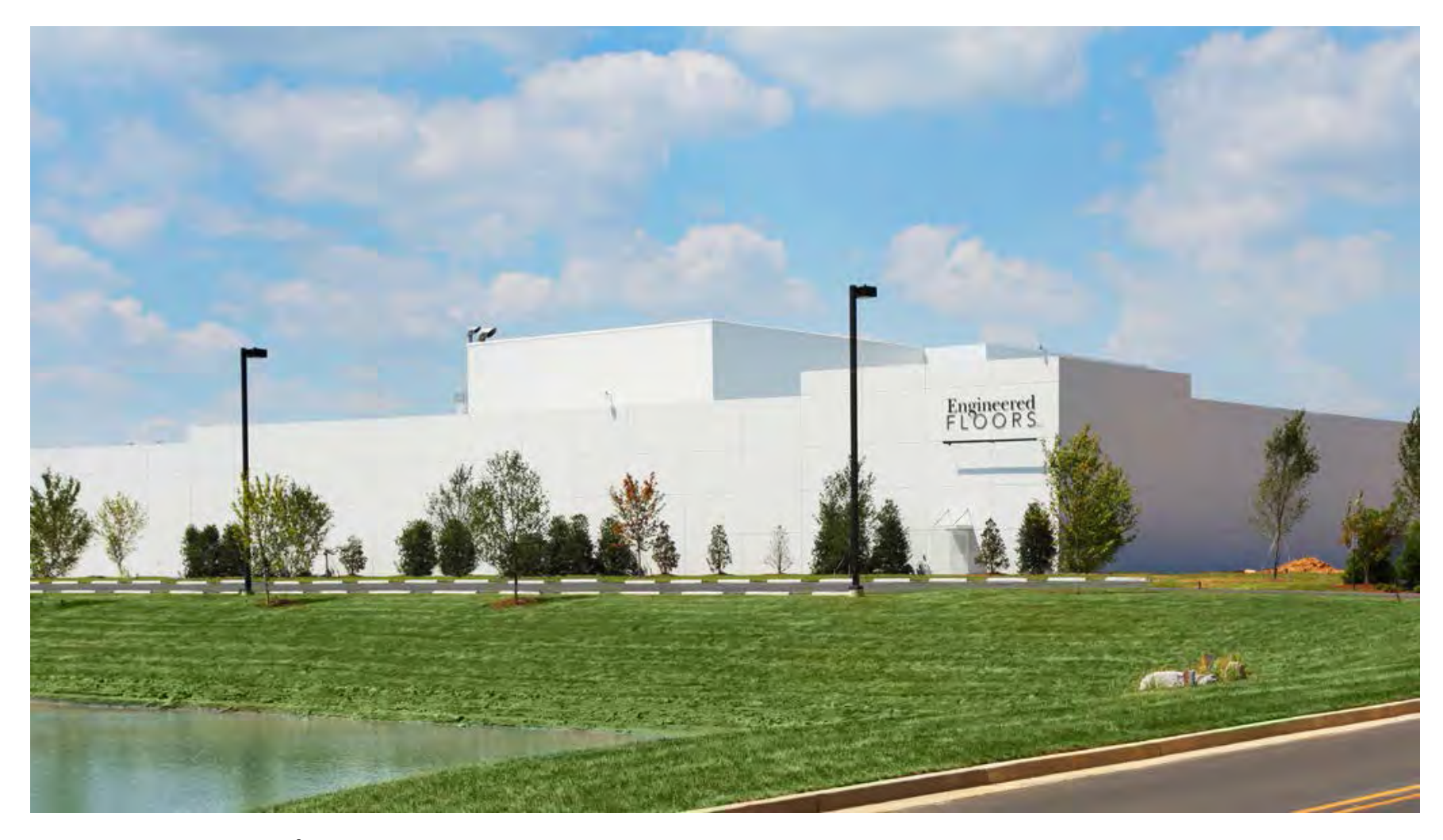
Engineered Floors / Calhoun, GA 492,000 sf industrial metal building