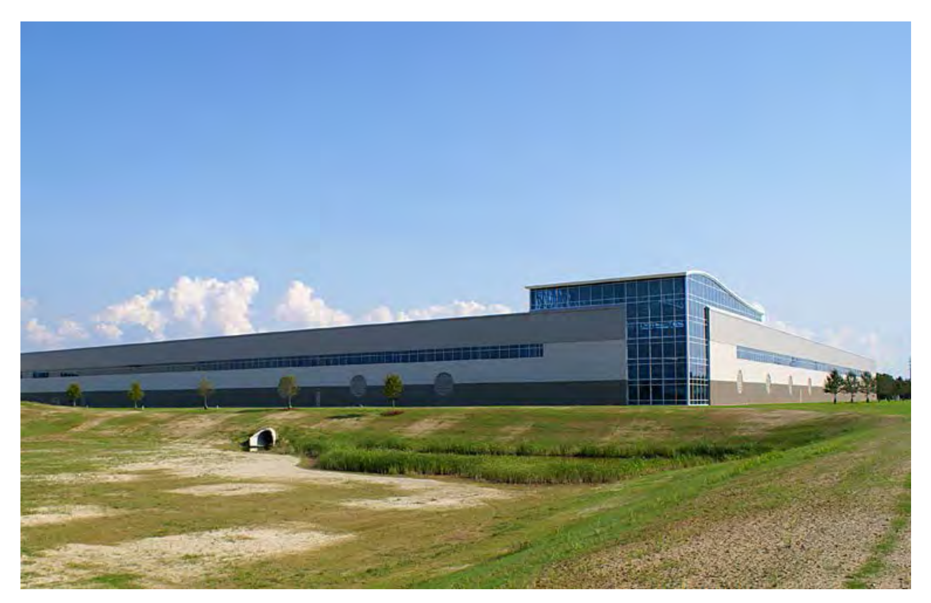
Tiara Yachts / Holland, MI

312,000 sf Custom yacht manufacturing facility with long spans up to 80' and monorail cranes