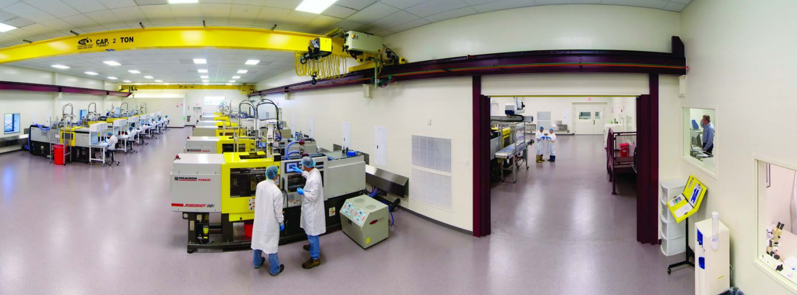
Vision Technical Molding / Manchester, CT

50,000 sf Medical manufacturing facility with clean rooms, warehouse and tooling area