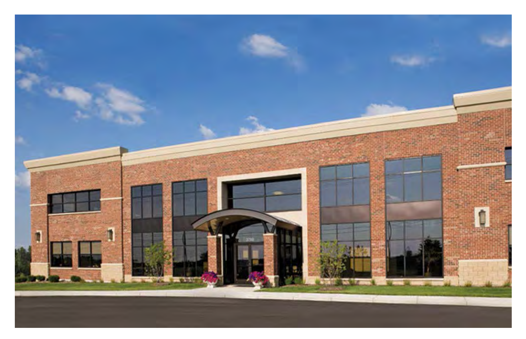
Action Fabricators, Kentwood, MI 66,440 sf manufacturing facility