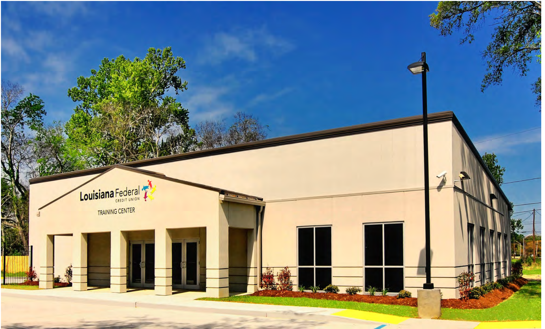
Louisiana Federal Credit Union / LaPlace, LA 4,400 sf Training and storage facility