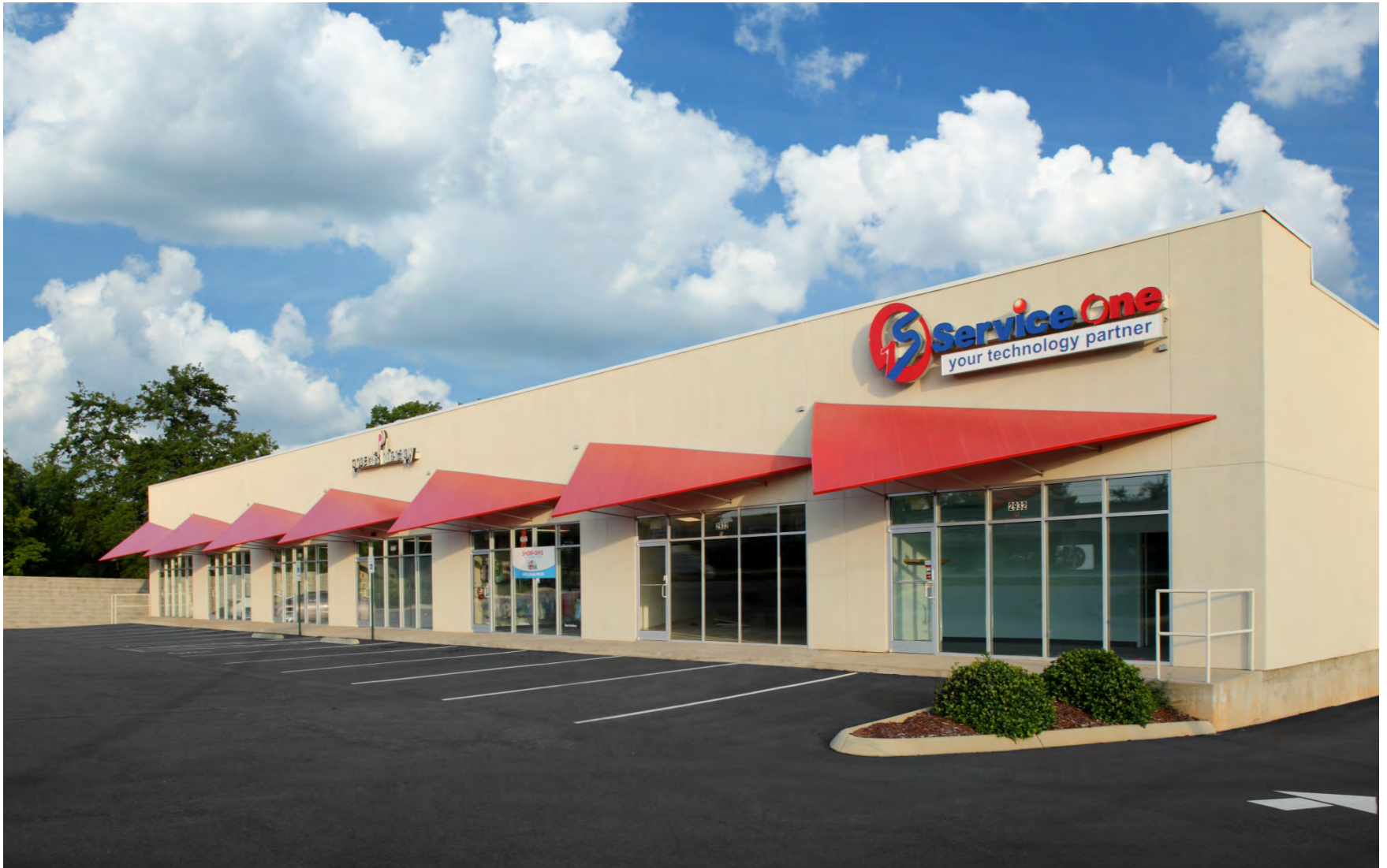
Reidville Road Retail Center / Spartanburg, SC Retail strip mall