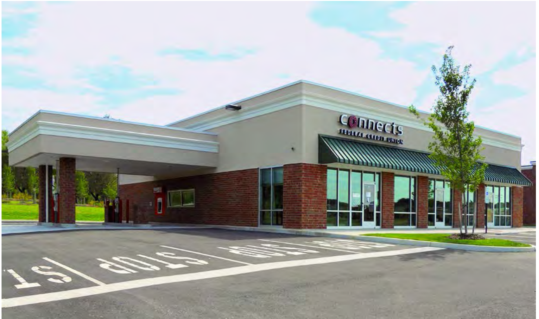
Connects Federal Credit Union/ Mechanicsville, VA 4,900 sf Single slope building with attractive brick and EIFS finish.