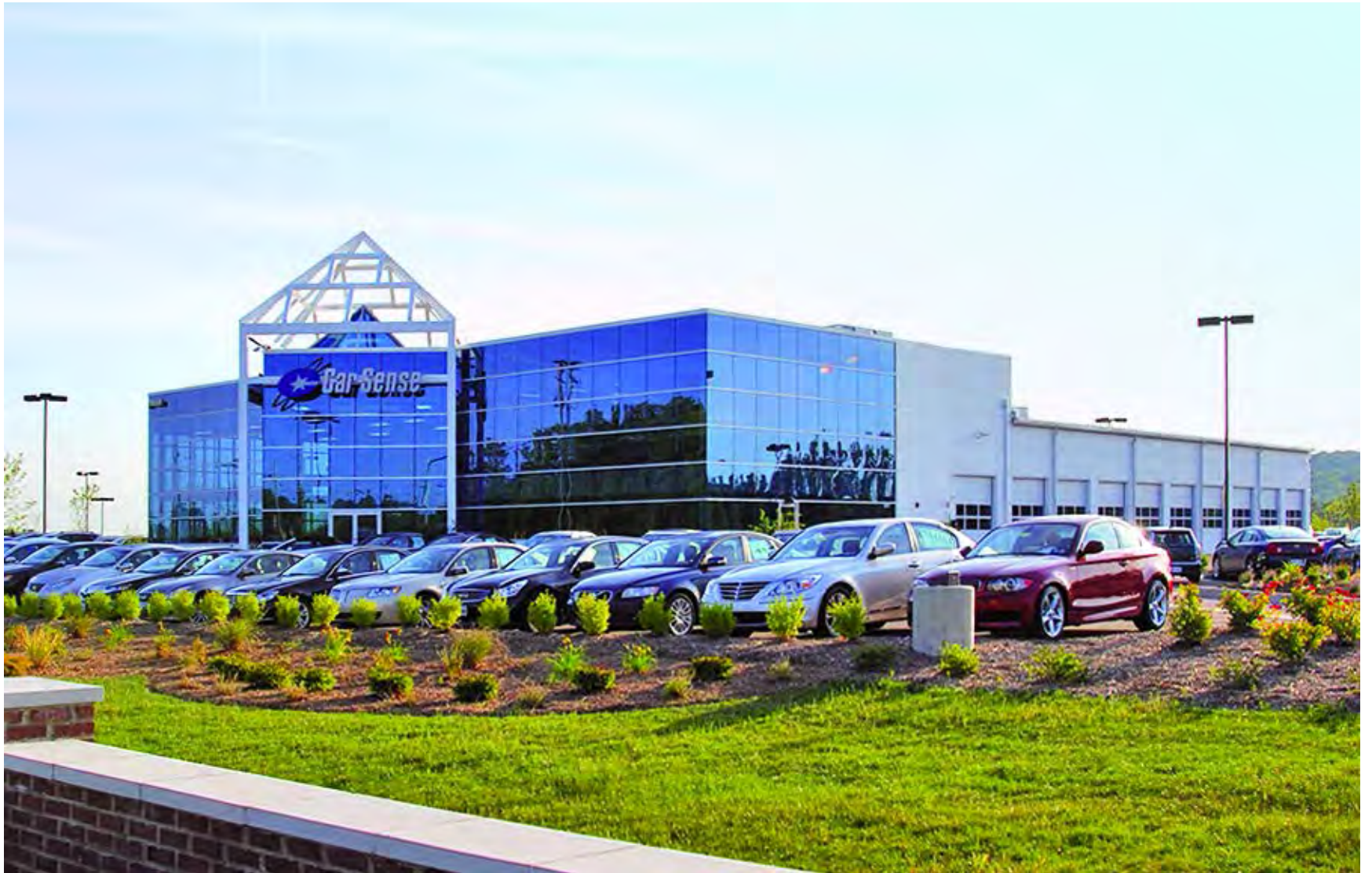
Carsense / Cranberry Township, PA 13,800 Car dealership with Nucor CFR roof